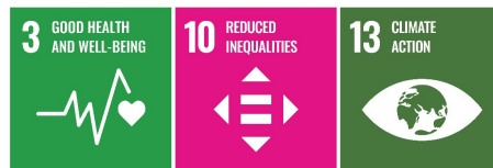
United Nations Sustainable Development Goals

“We have to be bold in our national ambitions. First, we must win the fight against poverty within the next decade. Second, we must improve moral standards in government and society to provide a strong foundation for good governance. Third, we must change the character of our politics to promote fertile ground for reforms.” —Gloria Macapagal Arroyo, Filipino academic 14 th president of the Philippines, 2001–2010