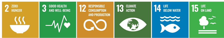
United Nations Sustainable Development Goals

“Saving our planet, lifting people out of poverty, advancing economic growth... these are one and the same fight. We must connect the dots between climate change, water scarcity, energy shortages, global health, food security and women’s empowerment. Solutions to one problem must be solutions for all.” — Ban Ki-moon, 8 th secretary-general of the United Nations