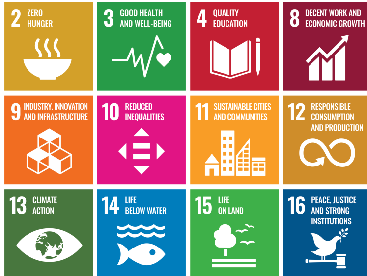
United Nations Sustainable Development Goals Addressed by Laurier Researchers