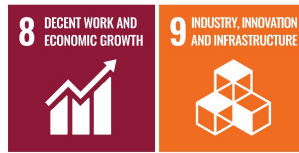
United Nations Sustainable Development Goals

“If you want to build a ship, don’t drum up people to collect wood and don’t assign them tasks and work, but rather teach them to long for the endless immensity of the sea.” — Antoine de Saint Exupéry [1900–1944]