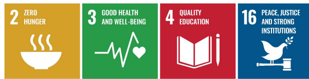
United Nations Sustainable Development Goals

“Health is a state of complete mental, social and physical well-being, not merely the absence of disease or infirmity.” — World Health Organization, 1948