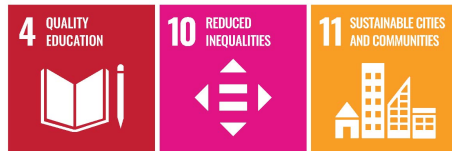
United Nations Sustainable Development Goals

“We shall overcome because the arc of the moral universe is long but it bends toward justice.” — Dr. Martin Luther King Jr., Remaining Awake Through a Great Revolution . Speech given at the National Cathedral, March 31 st , 1968